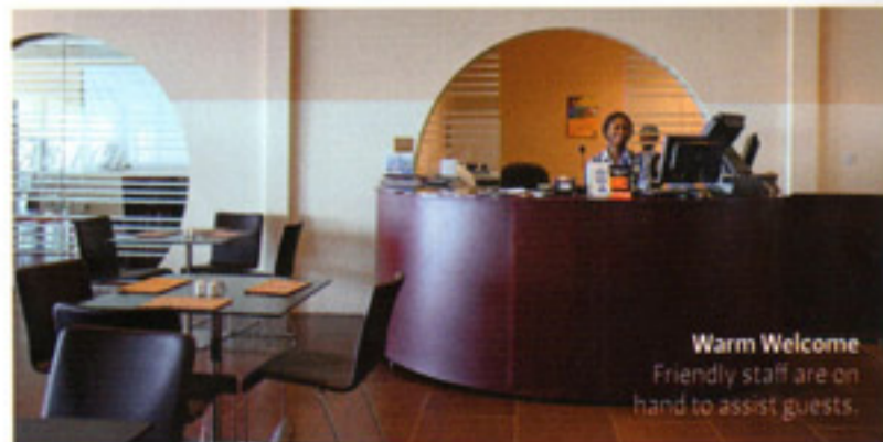
Warm Welcome Friendly staff are on hand to assist guests.

In addition to comfort and business facilities, the new departure lounge is the first in Nigeria to contain a Wellness Centre with trained therapists offering a range of treatments including Thai healing massage, a foot spa, head and